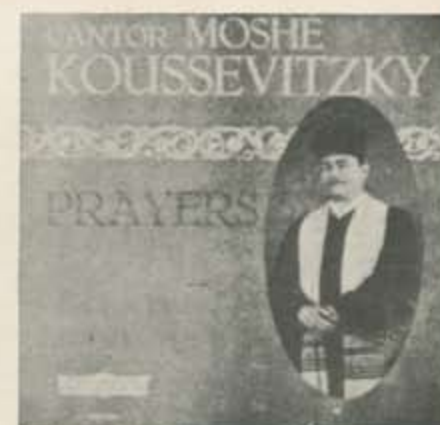
FAM-1004 PRAYERS sung by Moshe Koussevitzky